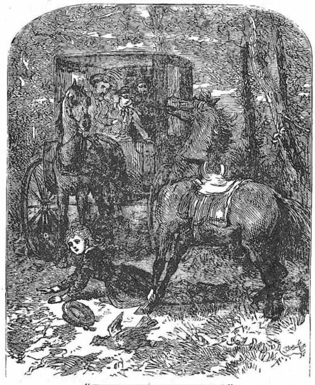
"WHICH CAUSED BARKIS TO SHY."

hurry. One look was enough, and, with a cry of delight, Rose was off down the road as fast as Barkis could go.