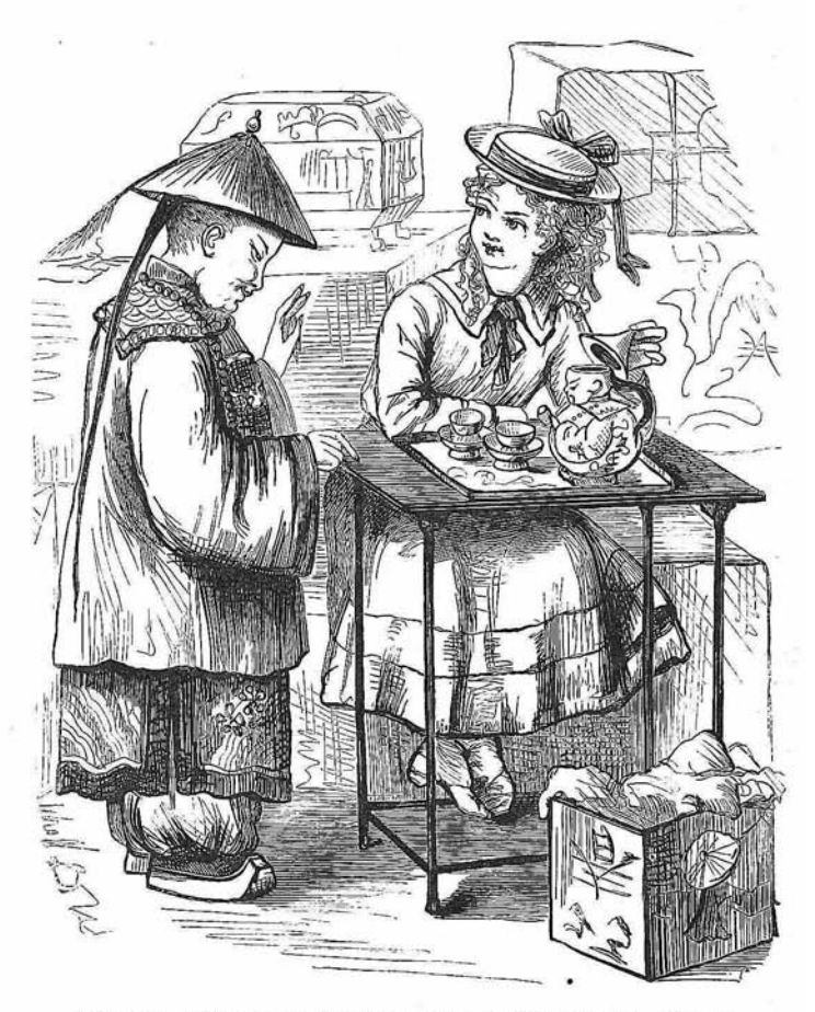
Fun signified in pantomime that they were hers .- Page 79.