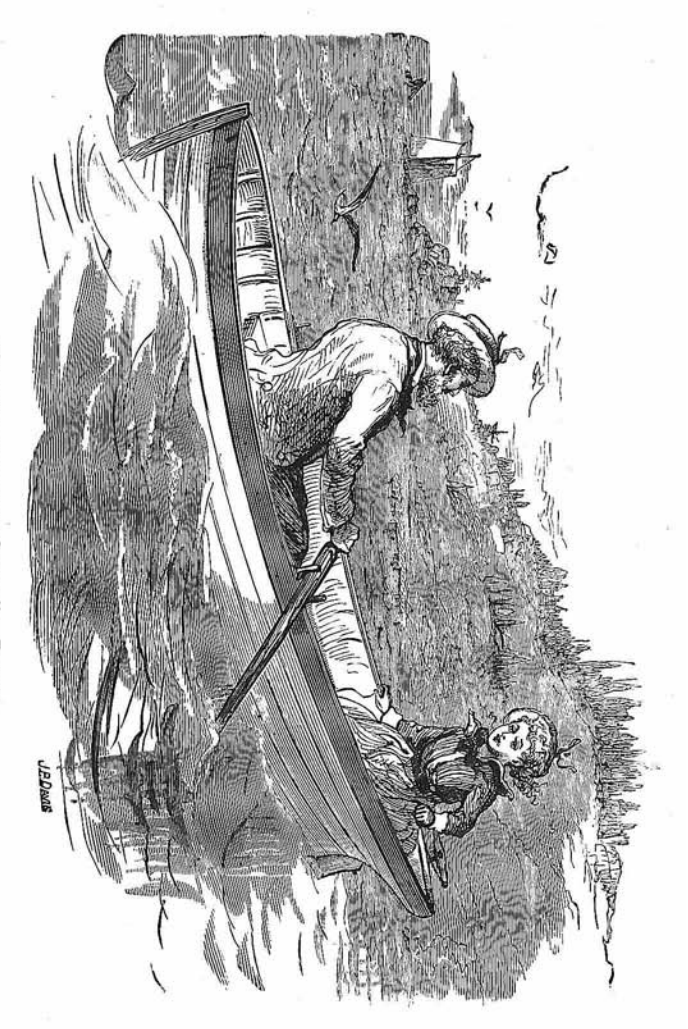
"Suppose we go to China." - Page 74.