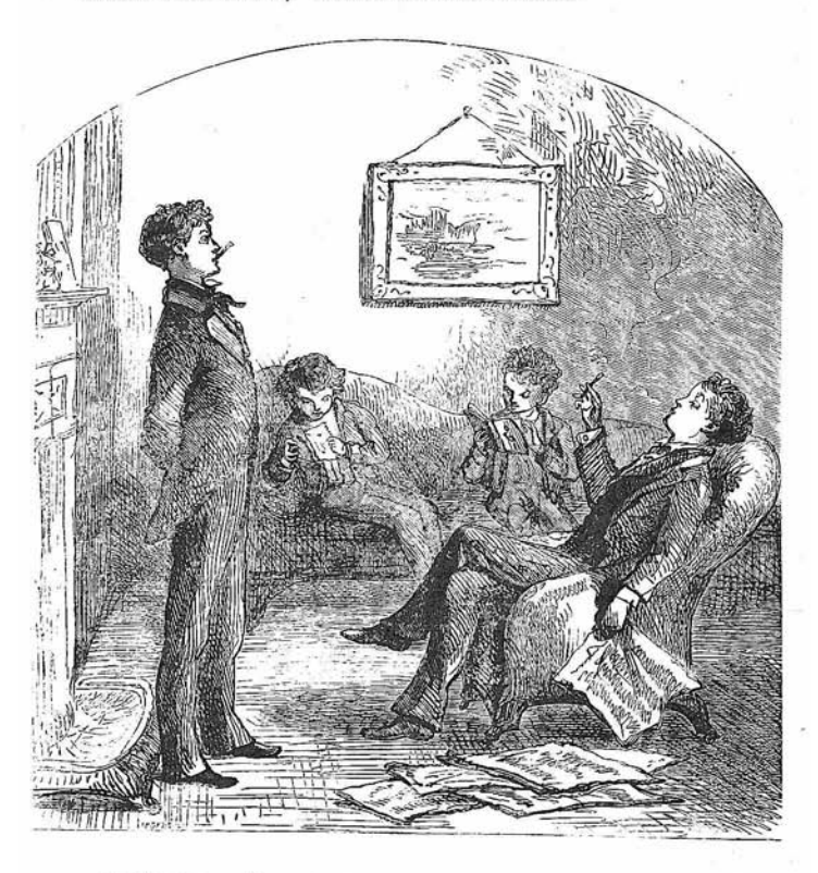
"It's Rose," and Archie threw his cigar into the fire.