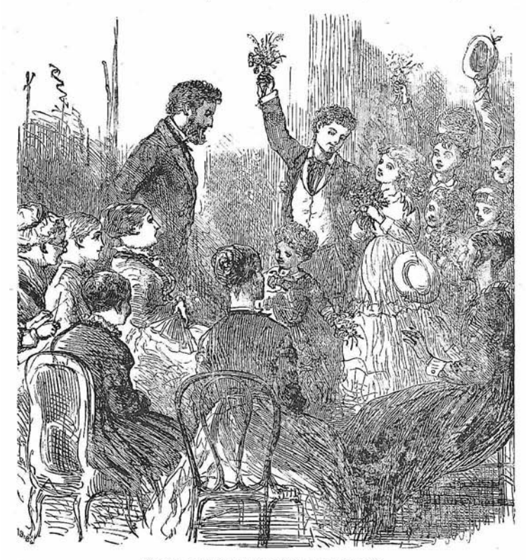
"THE COUSINS HAD BEEN A-MAYING."

and sighed, and telegraphed to one another that none of them would complain if not chosen, or ever try to