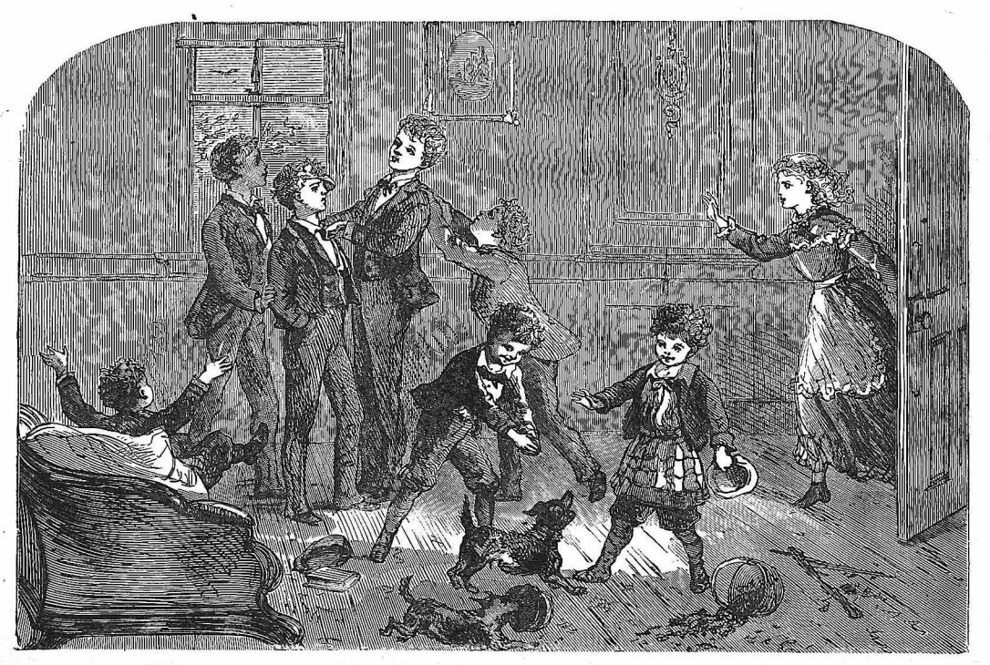
"The spectacle that met Nurse Rose's eye was a trying one." - Page 131