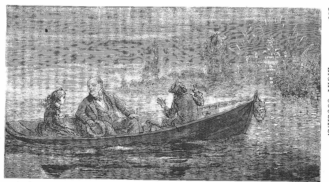
"THAT WAS RATHER A NEAT THING, I FLATTER MYSELF," SAID UNCLE MAC. - Page 117.