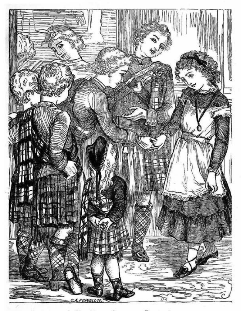
THE EIGHT COUSINS. - Page 10.