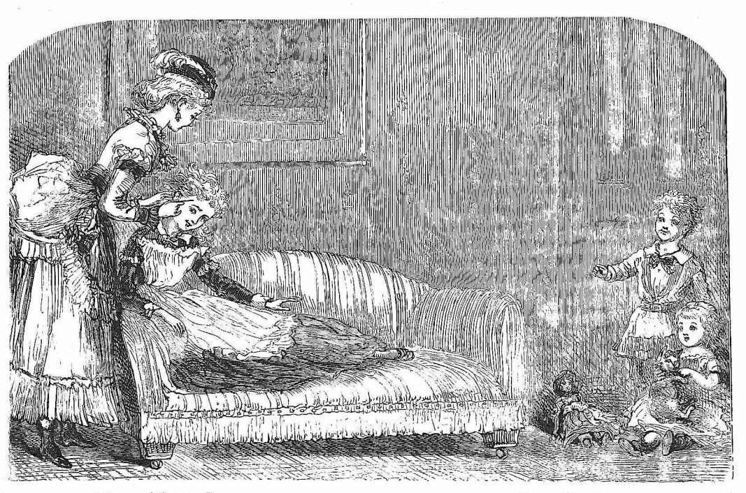
"Punch!" said Rose, in the tone of one giving the order "Fire!" - Page 170.