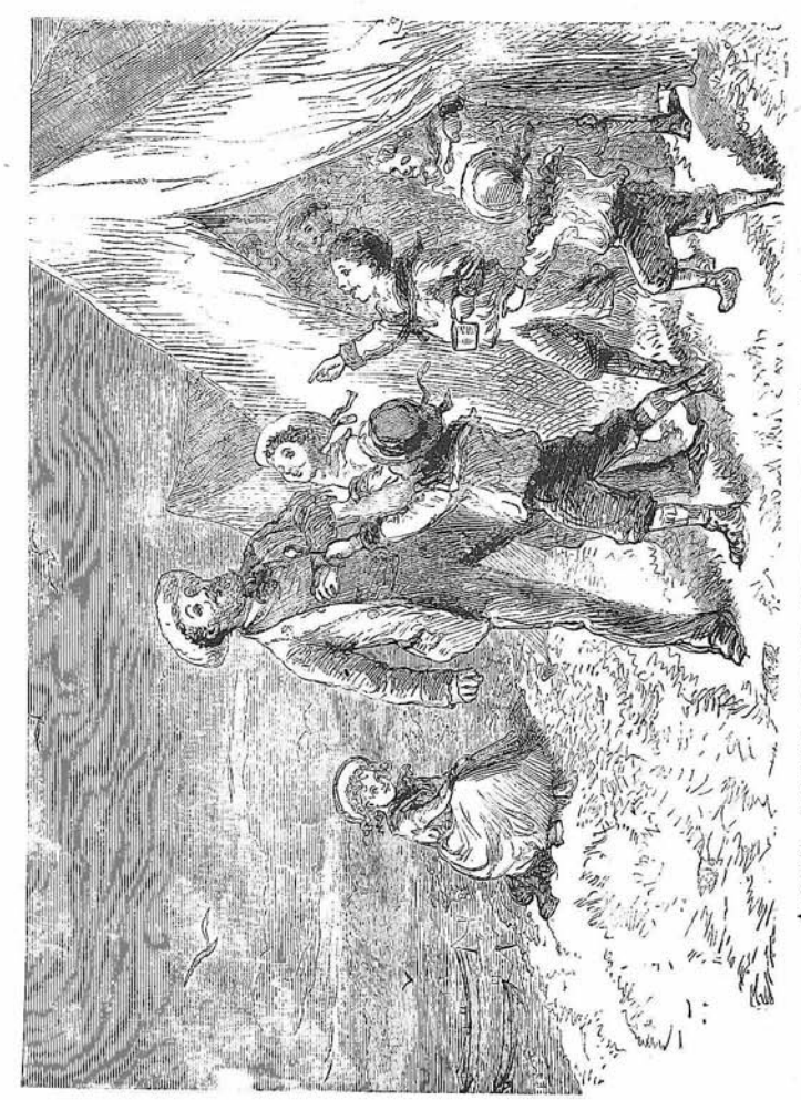
A CRASH, A SHOUT, A LAUGH, AND OUT CAME THE SAVAGES.—Page 99.