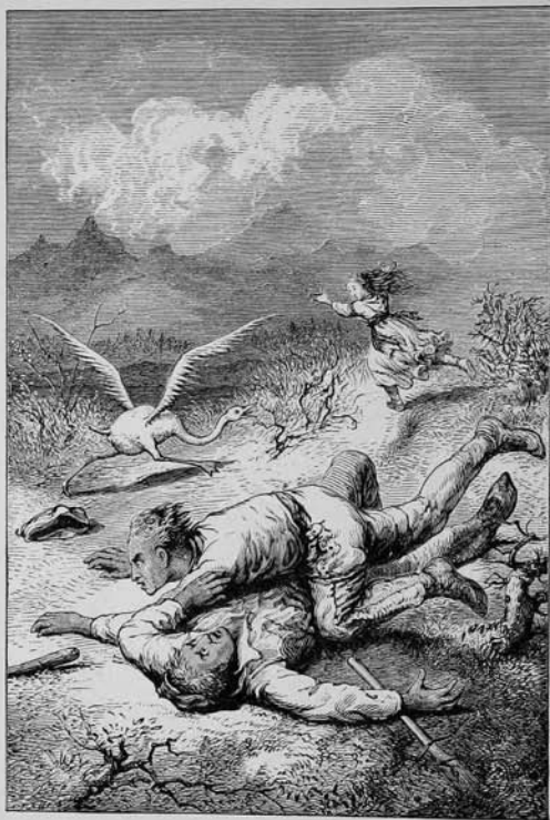
A WILD-GOOSE CHASE.—PAGE 64.