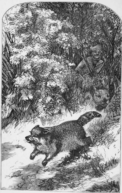
A RACCOON HUNT IN TEE BUSH.