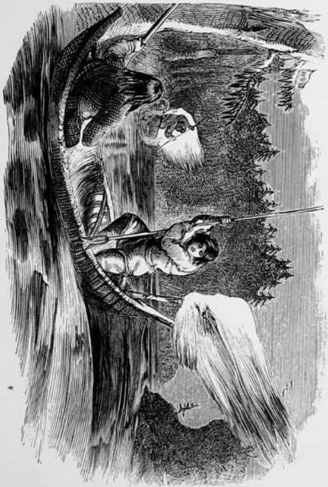
SPEARING FISH BY TORCHLIGHT.