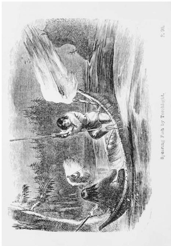
Spearing Fish by Torchlight.