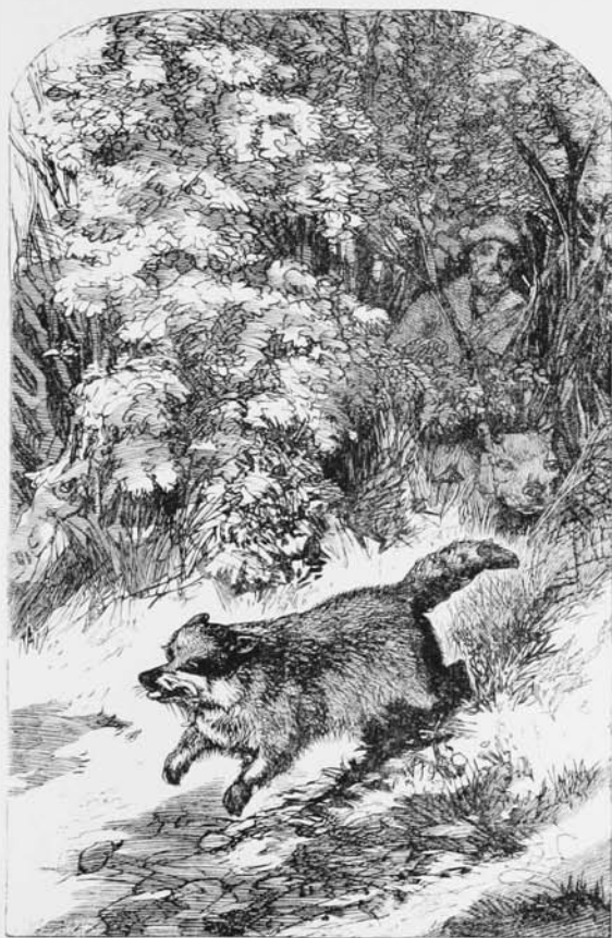
A Raccoon Hunt in the Bush.