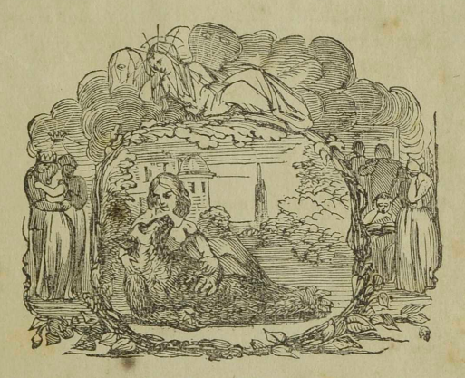
and threw it into his face. The Beast opened his eyes

the table, and then went to bed again, where she soon fell asleep. She was quite relieved, on waking, to find herself back in the palace, and waited impatiently till supper time, but nine o'clock struck, and no Beast appeared. Beauty then seriously feared she had caused his death, and running into the garden towards the spot she had dreamt of, she saw the poor Beast lying senseless on the grass. She threw herself upon his body in despair, when feeling that his heart still beat, she ran to fetch some water from a neighbouring stream,