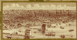
CITY OF TORONTO