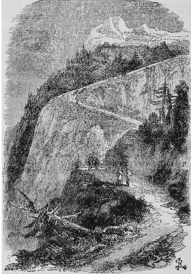
HORSE ROAD OVER THE ROCKY MOUNTAINS.