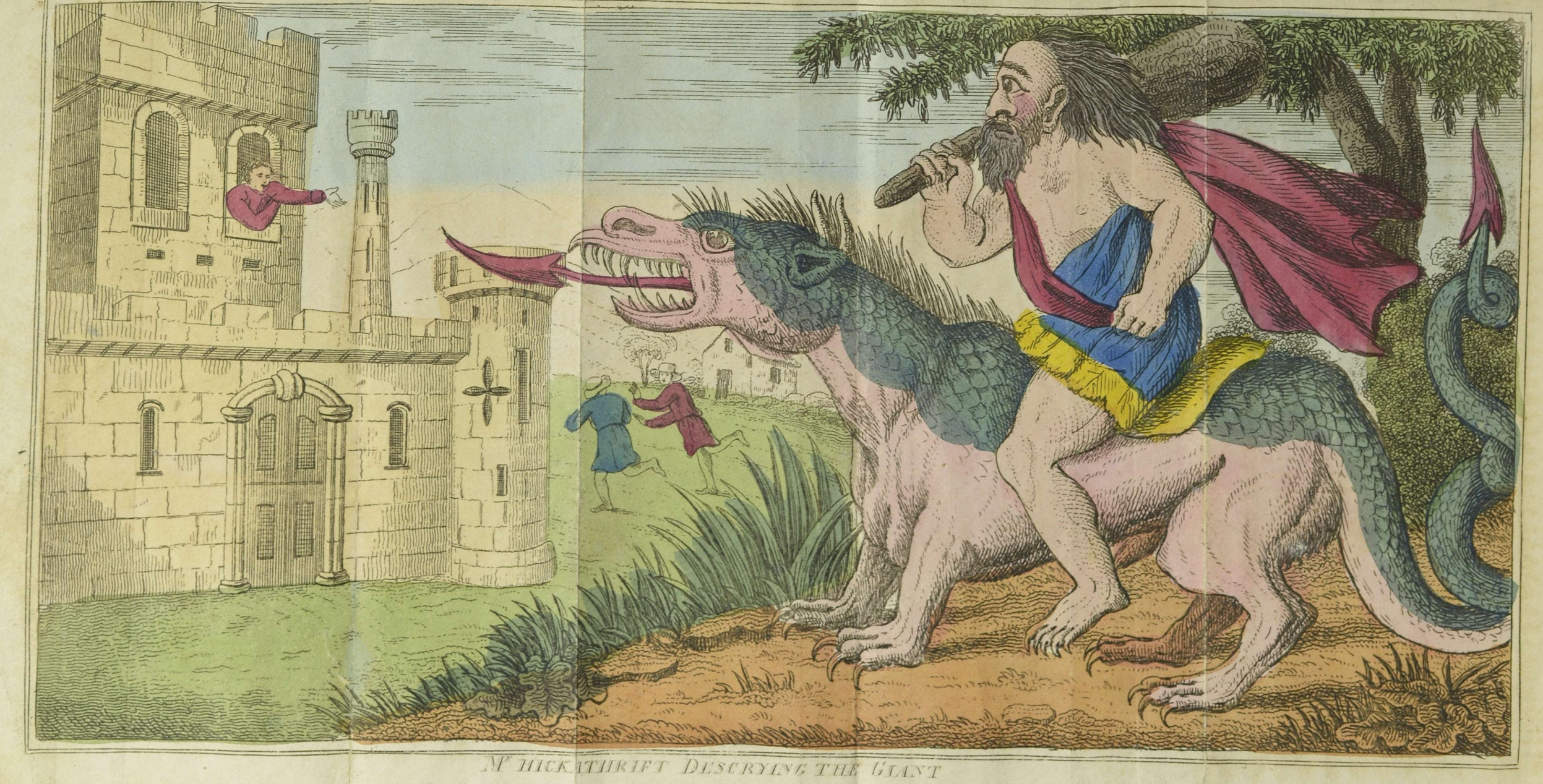
FROM ONE OF THE HINDOWS OF HIS CASTLE MOUNTED ON A DRACON