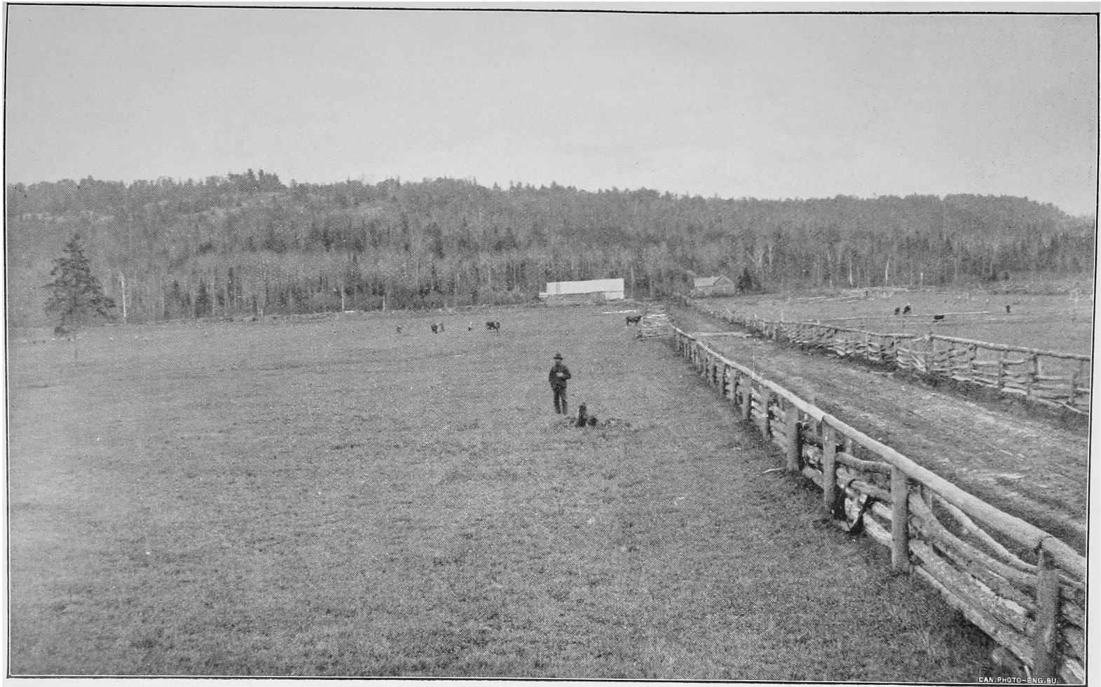
FARM OF S. B. OSBORNE, ECHO BAY, TOWNSHIP OF MACDONALD, PART OF SECTION No. 21, 80 ACRES, 25 ACRES CLEARED. SETTLED FOURTEEN YEARS AGO. FROM A PHOTOGRAPH BY PARK & CO., BRANTFORD, OCTOBER, 1894.