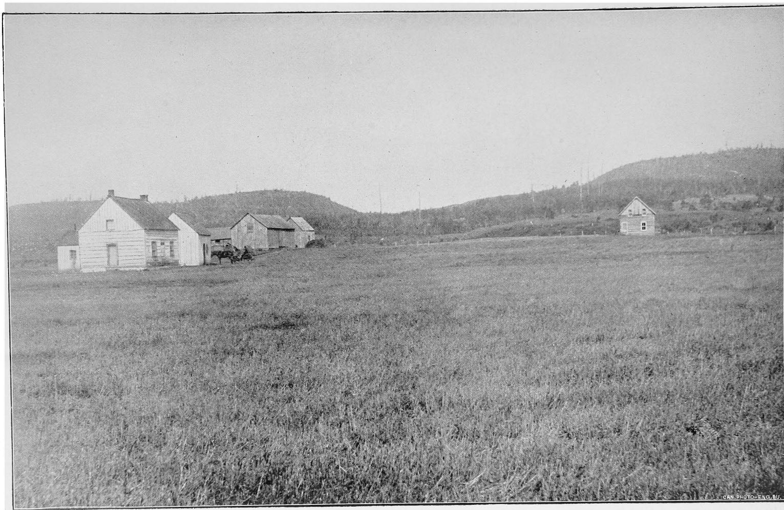
FARM OF W. N. MURPHY, MATTAWA P.O., LOT 37, CON. D, TOWNSHIP OF MATTAWA, CONTAINING 700 ACRES, 200 ACRES CLEARED. FROM A PHOTOGRAPH BY PARK & CO., BRANTFORD, OCTOBER, 1894.