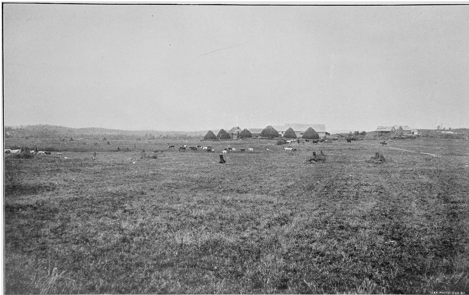
FARM NEAR CALLANDER STATION, C.P.R. FROM A PHOTOGRAPH BY PARK & CO., BRANTFORD, OCTOBER, 1894.