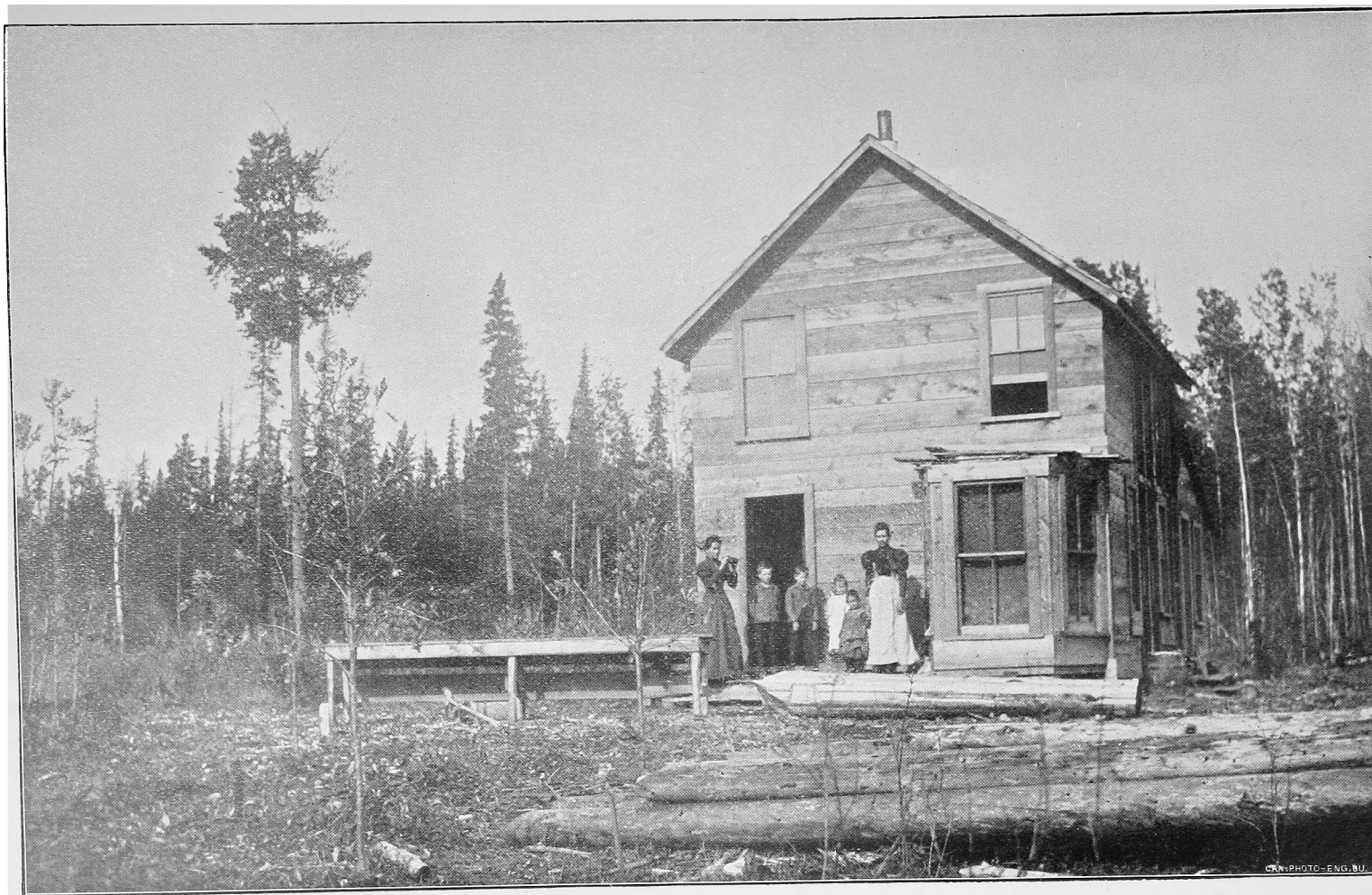
HOUSE AND CLEARING OF JOHN ARMSTRONG, LISKARD, LOT 7, CON. 8, TOWNSHIP OF DYMOND, NORTH-WEST SHORE OF LAKE TEMISCAMING, 320 ACRES, 25 CHOPPED. WORK COMMENCED JUNE 1, 1894.