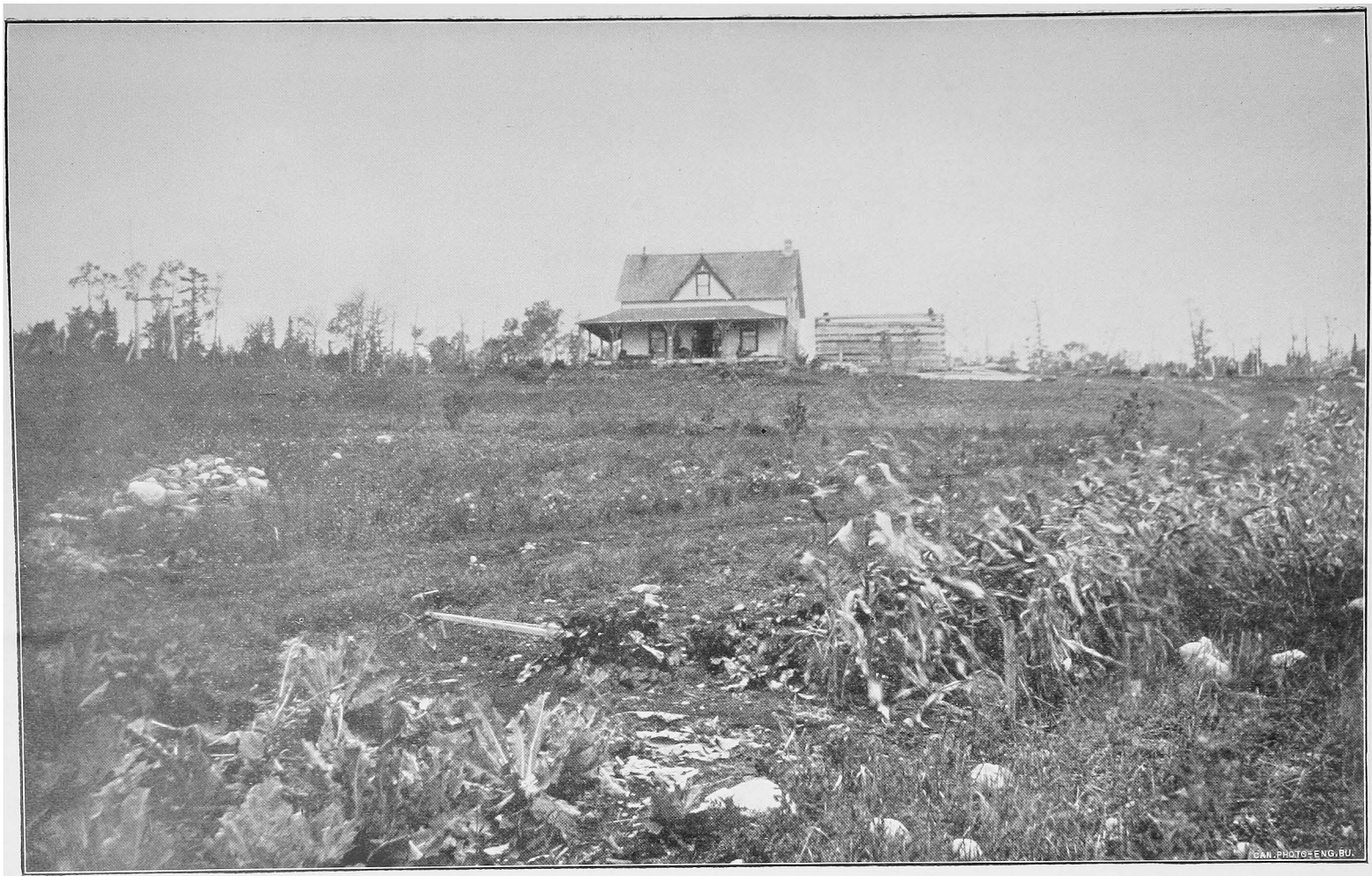
HOUSE OF C. C. FARR, HAILEYBURY, TOWNSHIP OF BUCKE, NORTH-WEST SHORE OF LAKE TEMISCAMING, 400 ACRES, 80 ACRES CLEARED. FROM A PHOTOGRAPH BY PARK & CO., BRANTFORD, OCTOBER, 1894.