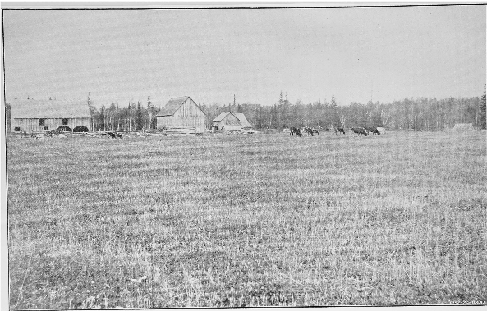
FARM OF ARCHIE BROWN, WARREN P.O., LOT 2, CON. 5, TOWNSHIP OF DUNNET, 320 ACRES, 75 ACRES CLEARED. CLEARING COMMENCED IN THE FALL OF 1888. FROM A PHOTOGRAPH BY PARK & CO., BRANTFORD, OCTOBER, 1894.