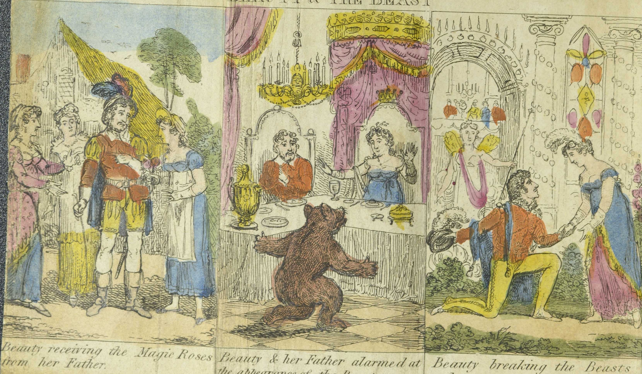
the appearance of the Beast.