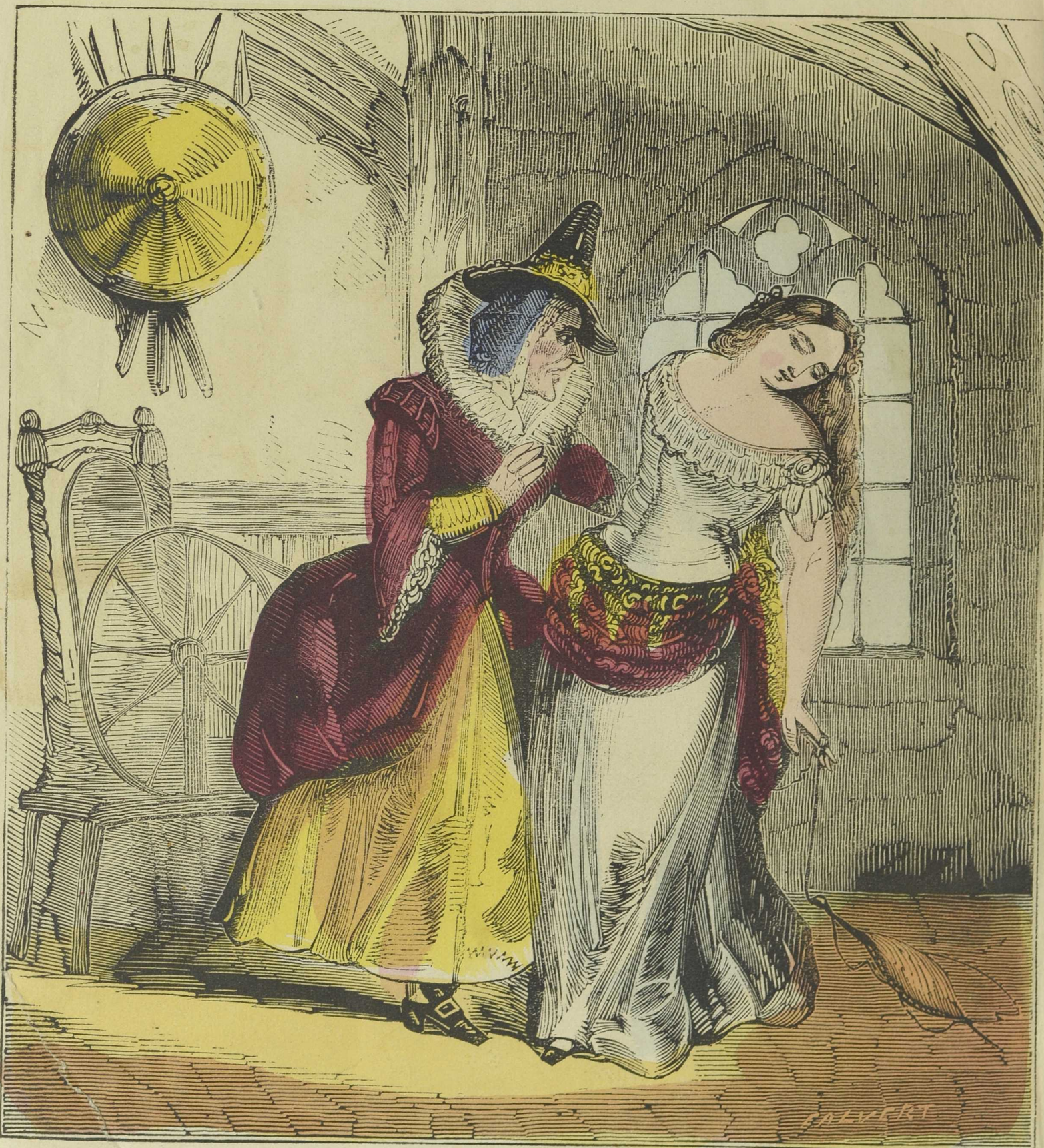
The Princess fainting, after piercing her hand with the Spindle.

T HERE were, many, many years ago, a king and queen who had no children, which made them very unhappy indeed. Hoping by some means or other to have an heir, they agreed to consult all the fairies they could hear of: vows, pilgrimages, every thing was tried, but without success.