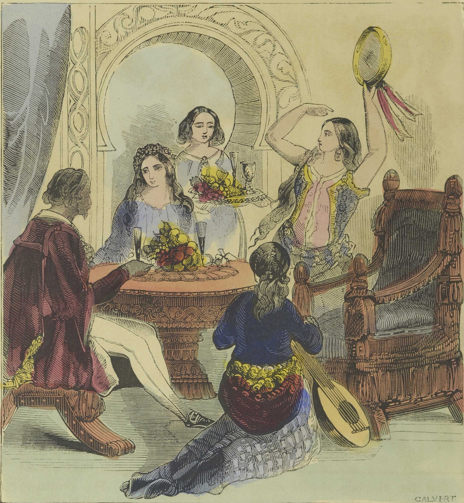
The Princess taking refreshment after her long sleep.

He took her hand, and conducted her to the apartment in which the refreshments were served, and as soon as they were seated at the table, the musicians, who were in readiness with their instruments, began to play some airs; which, although very old, were nevertheless extremely agreeable. In fact, the prince felt himself so happy, with the old-fashioned appearance of every thing that met his view, whichever way he looked, and which seemed to borrow a charm from the beautiful princess, that he was completely filled with pleasure.