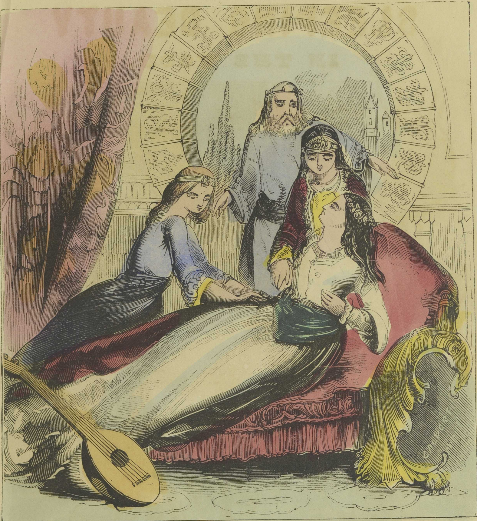
Sleeping Beauty conveyed to her couch after her accident.

Some time after this, it was proclaimed that the queen was going to have a child, and shortly after a princess was born. The christening was the most sumptuous imaginable; and seven fairies, being all that could be found in the country, were invited to be her godmothers; so that each of them might bestow upon her a gift, as was the custom in those days.