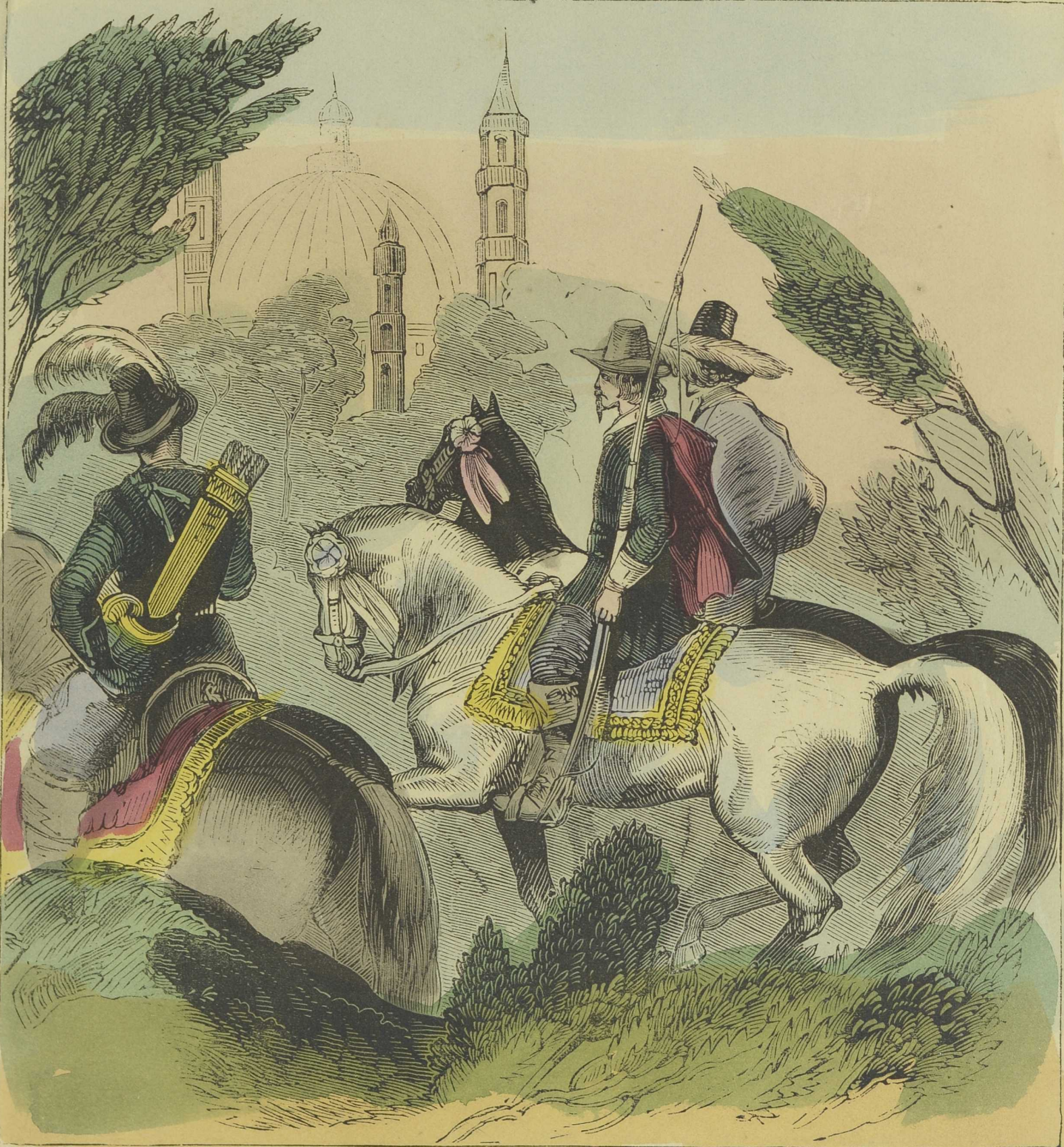
The Prince and his attendants hunting near Sleeping Beauty's Palace.

The attendants of the princess awoke at the same time, and commenced their several duties as if nothing had happened: even the fire, at which the joints and game had been roasting, suddenly re-kindled; and the cook bustled about to have all things ready at what he supposed to be the proper time.