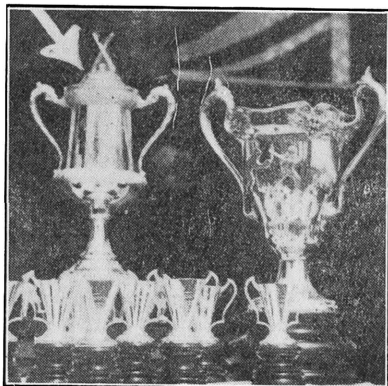
THE "RANDALL" CUP

This trophy is an exceptionally beautiful one. It stands about 20 inches high and measures 10 inches wide over all.