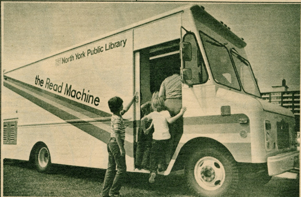
Library Pajama Parties delighted children (top left); Dr. David Suzuki (top right) spoke at Fairview Library; The Travellers (lower left) highlighted a 30th Anniversary Festival in Earl Bales Park; our Read Machines, compact mobile libraries, made their debut.