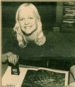
The Processing Department stamped its one-millionth accession number since records were first kept in 1973.