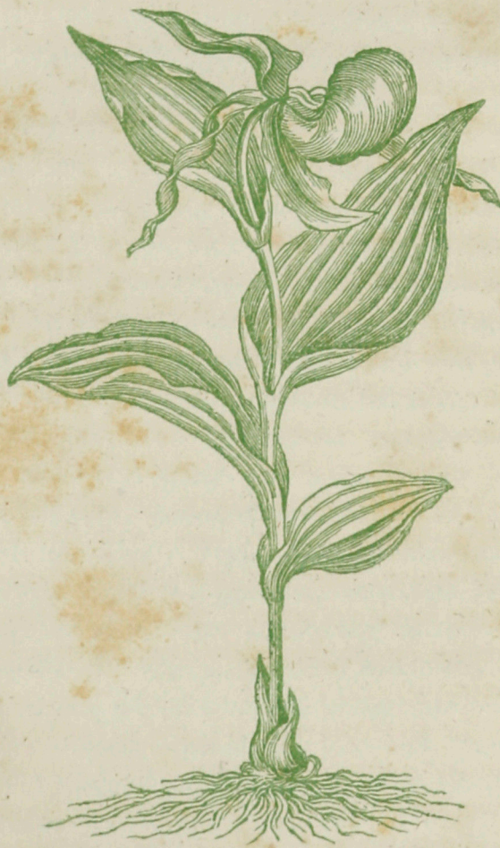
YELLOW LADIES' SLIPPER.