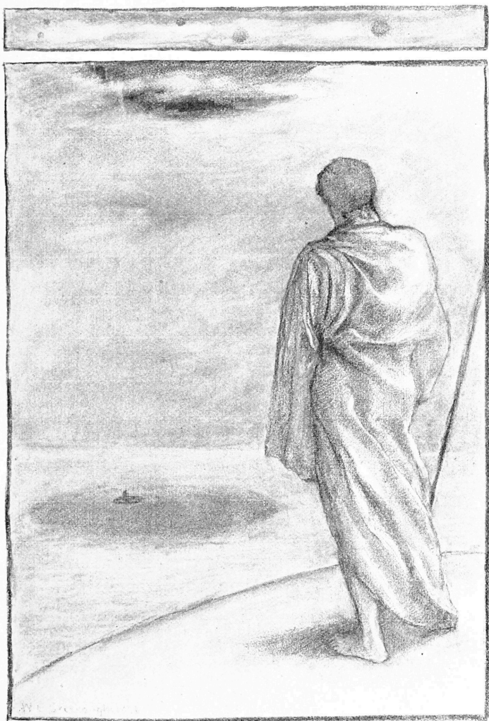
THORWALD DISCOVERS ONE OF THE EARTH-DWELLERS.