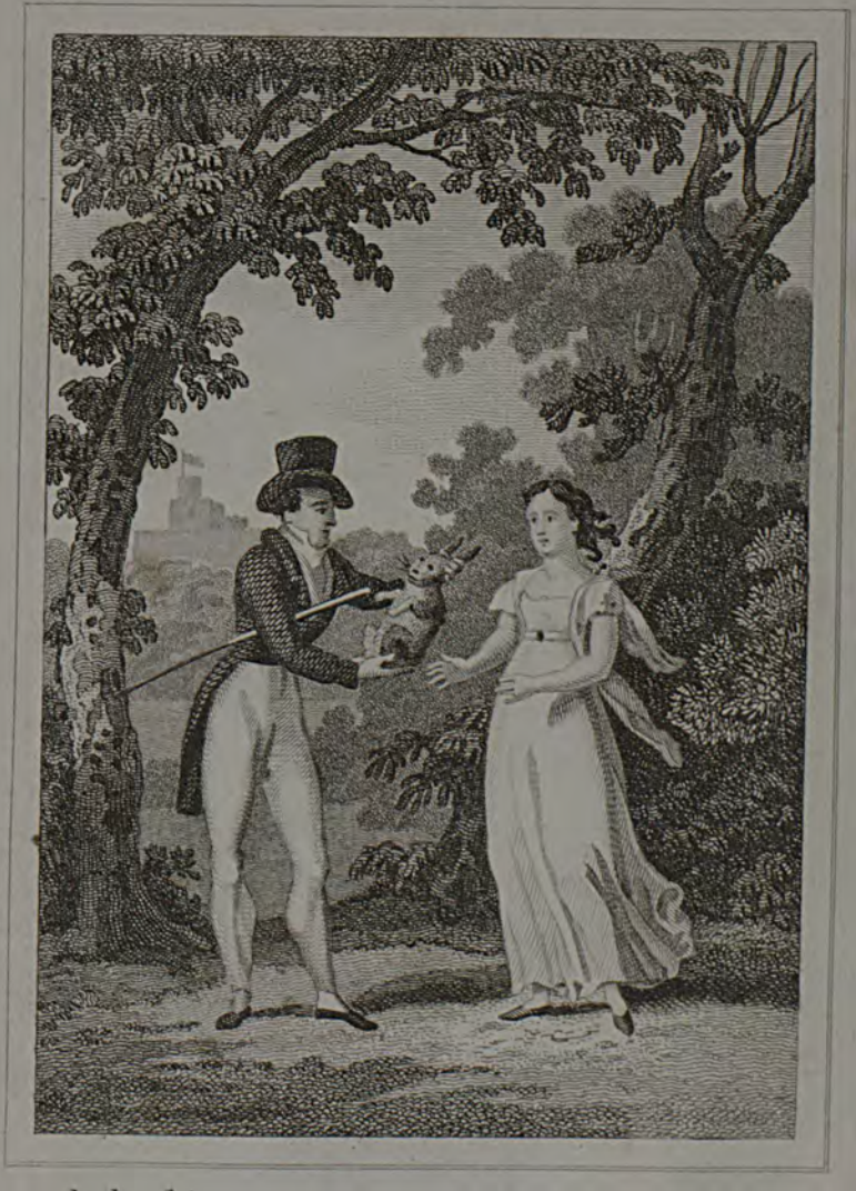
-and placed it, with his own hand, in that bosom which was prepared to receive it;